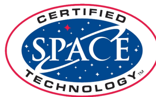
The Vollara Air & Surface Pro

ActivePure Technology is one of only 75 technologies that have been inducted into the Space Technology Hall of Fame.